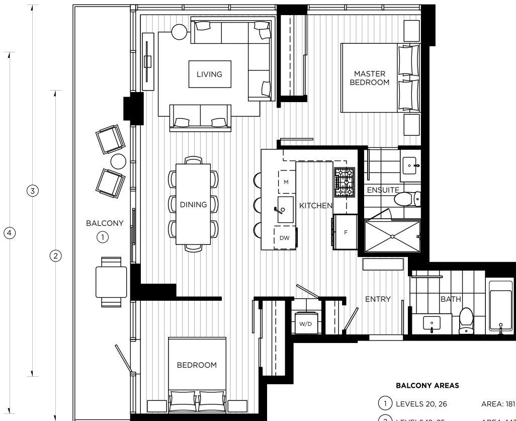
BALCONY WIDTH VARIATIONS

PLAN N 2 BEDROOM, 2 BATH INT: 876 sq ft EXT: 122-181 sq ft